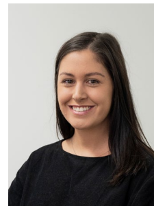
Student Development Coordinator