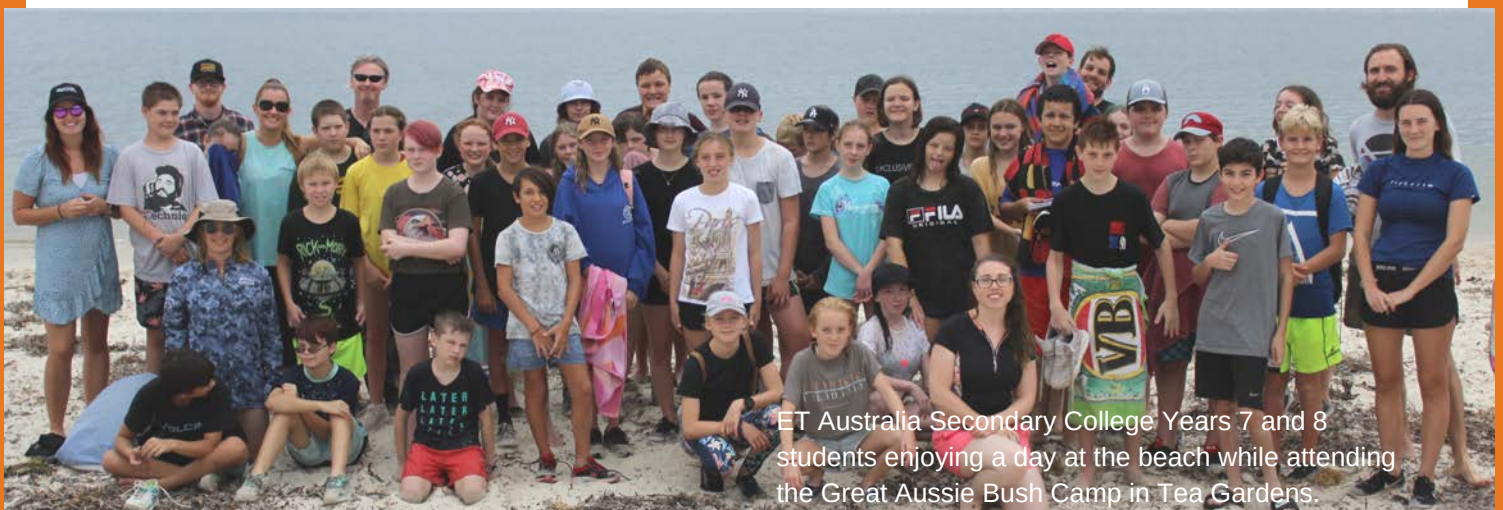
ET Australia Secondary College Years 7 and 8 students enjoying a day at the beach while attending the Great Aussie Bush Camp in Tea Gardens.

There are 2 students ETASC have been unable to contact so we cannot record an outcome for these students. The above outcomes for students confirms 95.3% success rate for ETASC with their pathway plans.