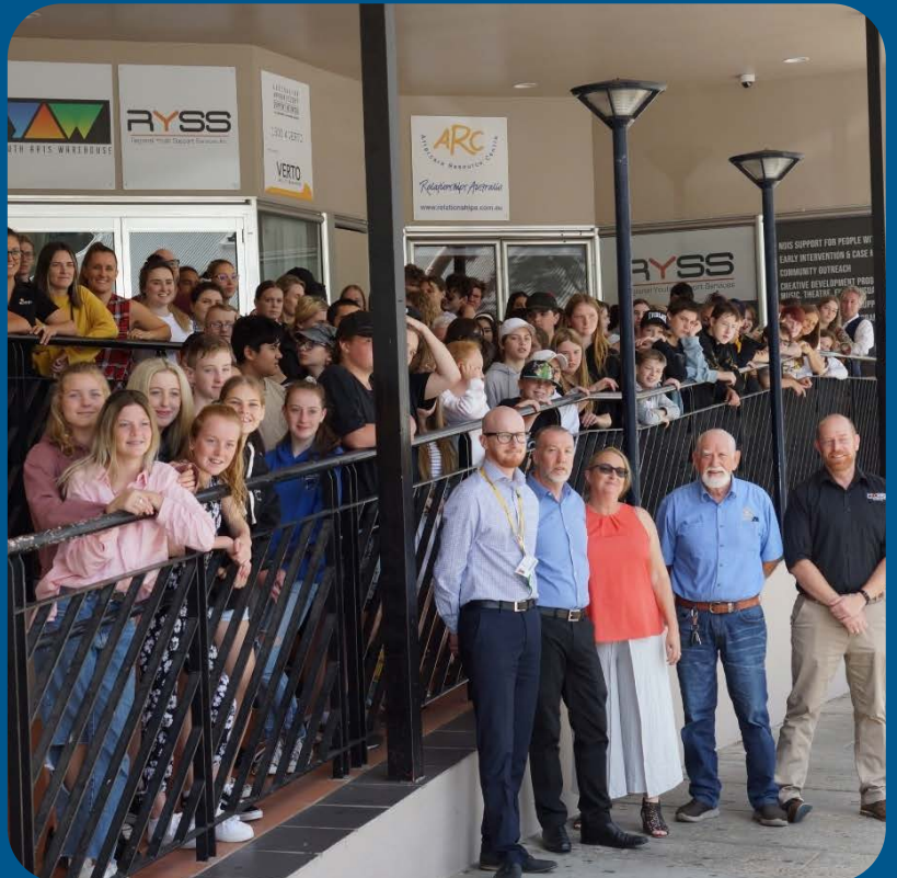
Parkside Multi-Service Youth Facilities tenants and ET Australia Secondary College students and staff mark their final day in the Parkside Building.

ET Australia moved out of the Parkside building after twenty years. ET Australia was a founding partner of the Parkside Multi-Service Youth Facility with Regional Youth Support Services (RYSS) twenty years ago. Since 2013, the Parkside building has been the home for ET Australia Secondary College. In 2021 ET Australia opened 2 new school campuses in the centre of Gosford – Years 7 to Year 10 in the Imperial Centre and Years 11 - 12 at 125 Donnison Street.