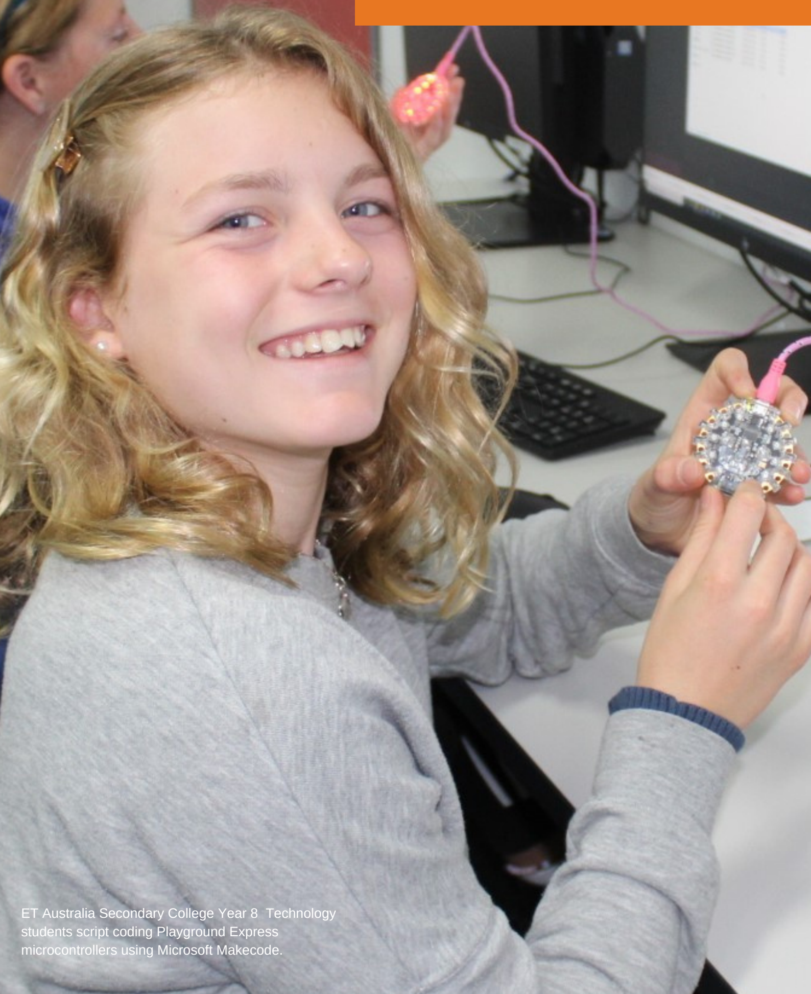
ET Australia Secondary College Year 8 Technology students script coding Playground Express microcontrollers using Microsoft Makecode.

Our school model provides educational opportunities for students who thrive in a small school environment.